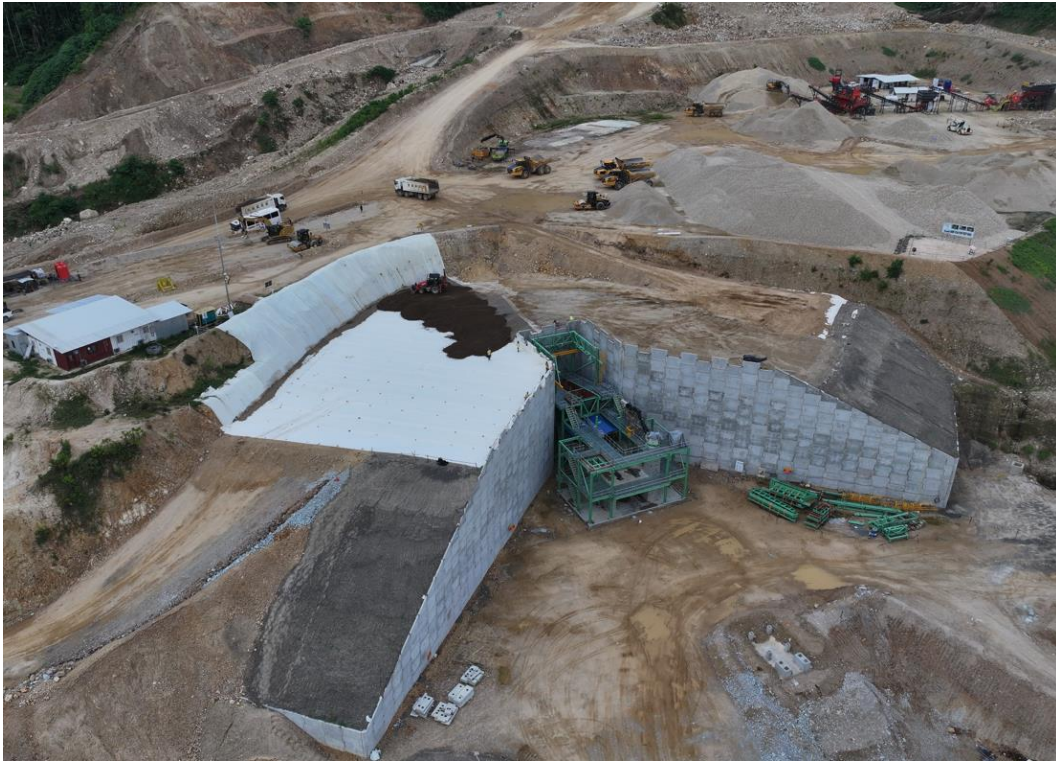
Figure 2: Primary Crushing, Ore processing plant