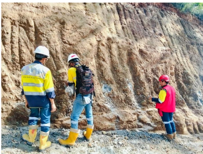
Figure 3: Mapping and Sampling in the Lerokis Area

During the quarter, exploration activities concentrated on regional targets and updating the mineral resource estimate for Lerokis. Geological mapping, grid sampling and channel sampling was carried out in the Lerokis, Kali Kuning and Partolang East areas. These programs followed up on the regional drilling results from 2024, and reviewed key targets in preparation for an IP geophysical survey which will begin in 2Q 2025.