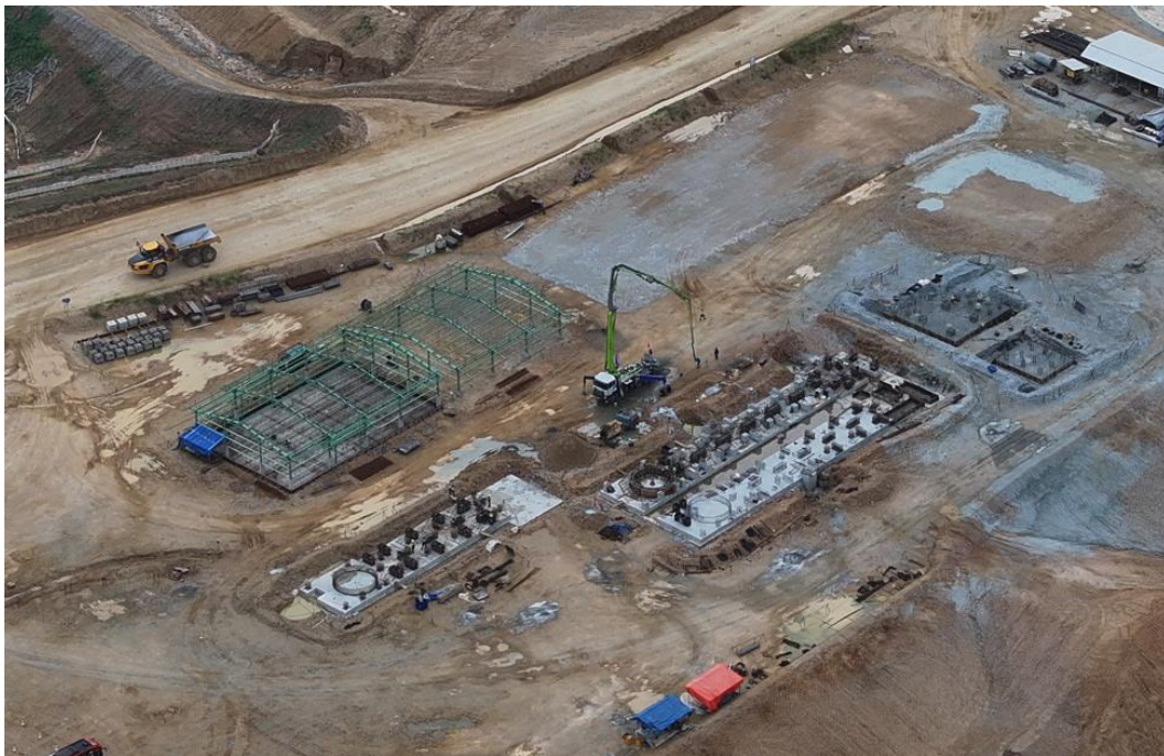
Figure 1: ADR Gold Plant

Detailed engineering is now complete and procurement is expected to be finalised by the end 2Q 2025. Site deliveries of fabricated packages and mechanical and electrical equipment are ramping up, with the bulk of shipments scheduled for 2Q 2025. All construction and installation contracts have been awarded and contractors are on site actively installing processing infrastructure, power distribution networks and supporting facilities including mine magazines, port infrastructure, bulk fuel storage facilities and incoming power systems from the national grid. PT PLN Indonesia Power ("PLN") remains on track to deliver 150 kVA of grid power by the end of 3Q 2025.