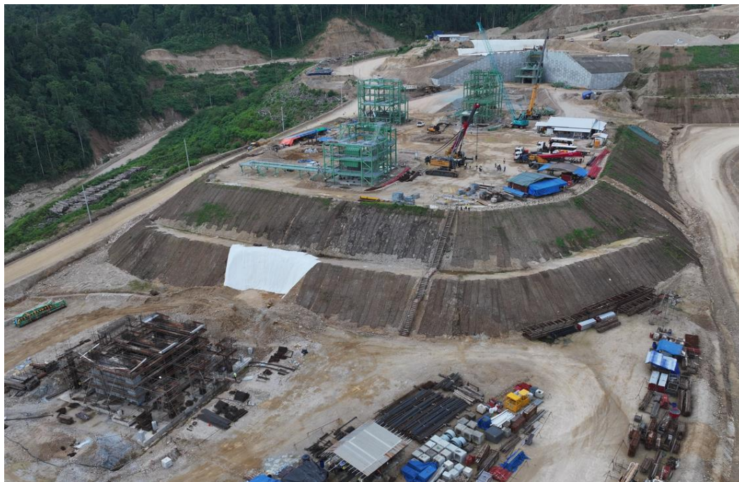
Figure 3: Ore processing plant construction